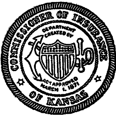
Kathleen Sebelius Commissioner of Insurance

IT IS SO ORDERED THIS 10 DAY OF FEBRUARY, 1999, IN THE CITY OF TOPEKA, COUNTY OF SHAWNEE, STATE OF KANSAS.